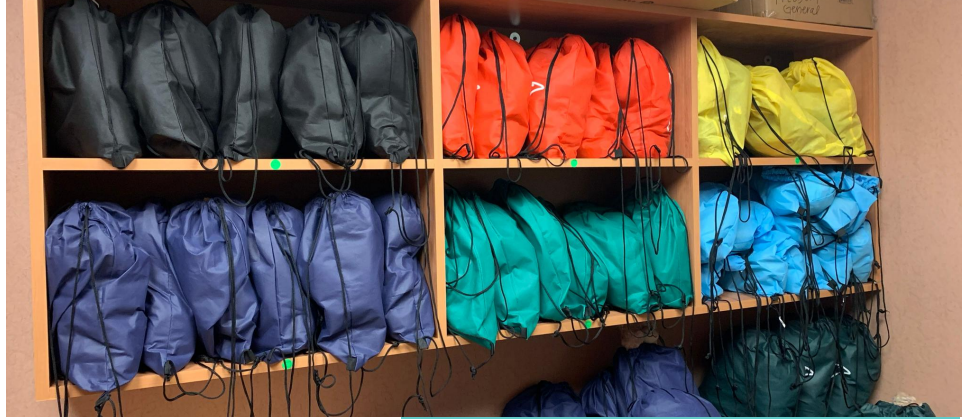
Above: AfterCare Kits available at the Norfolk Family Justice Center.

Having all of these services in the same location can be beneficial for survivors of sexual violence. They can receive medical and legal services in the same place while also being provided 24 hour trauma-informed care. According to a recent press release, they anticipate providing services to at least 3,500 victims through each fiscal year going forward.